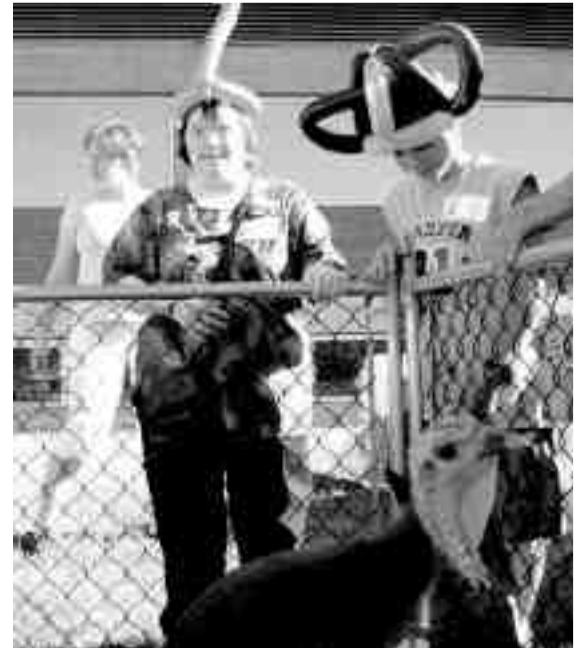
Wild turkey alert! Guests visit a turkey who was caught twice trying to “fly the coop” and chased along the Chrysalis front lawn by staff.