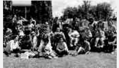
Friends new and old: Chrysalis AES staff and clients sit on the front lawn of Chrysalis on a July afternoon.

Many Human Services agencies are dealing with a staffing crisis and advocating for improved funding to support increased front line staff salaries. You can help by logging on to www.whocaresalberta.com .