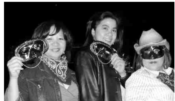
Chrysalis staff volunteers play with Mardi Gras masks

Special thanks to the following supporters: