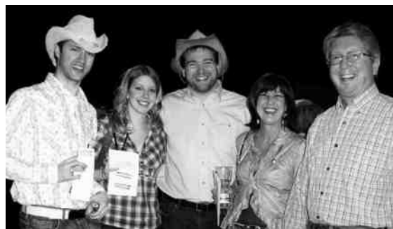
Guests laugh and enjoy casual conversation while browsing through 150+ silent auction items

Proceeds from this event will go towards renovations and purchasing new equipment to improve onsite day-programming areas.