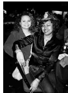
Guests sit and enjoy a delicious meal prepared by Northlands catering staff