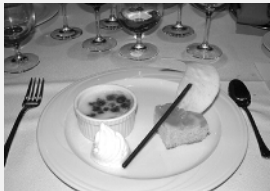
Spring Inspiration dessert

Thank you to all of those who assisted to make this event a success. All supporters make a difference in the lives of persons with disabilities. We look forward to seeing you all April 5, 2007!