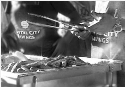
Capital City Savings' staff volunteering to serve breakfast

Chrysalis' 7 th Annual Capital EX Breakfast was held on Friday July 21 with the help of the title sponsor Capital City Savings and donations