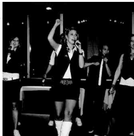
The SHINE emsemble of the Calgary Youth Singers perform for Spring Inspiration guests.