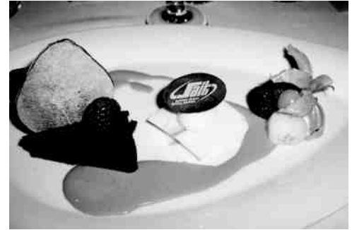
A delicious desert prepared by SAIT

The event raised $19,225 to enhance Chrysalis programs and services such as the Chrysalis Culinary Demonstration Program and the Chrysalis Active Leisure Center.