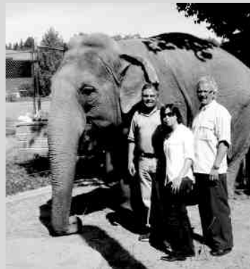
Special thanks to Lucy the Elephant and the Valley Zoo for donating a painting done by Lucy for our 2009 WMG auction.