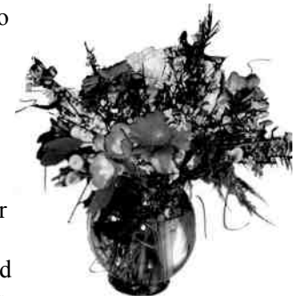
The wildflower centrepiece theme for Spring Inspiration.

Thanks to everyone who helped plant the seeds for another successful year of quality programs and services at Chrysalis.